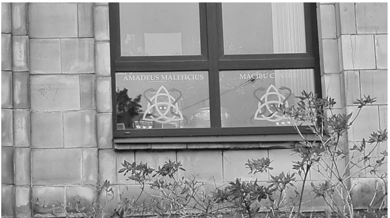
Fig.2. Amadeus Maleficium window at the Academy of Sciences building