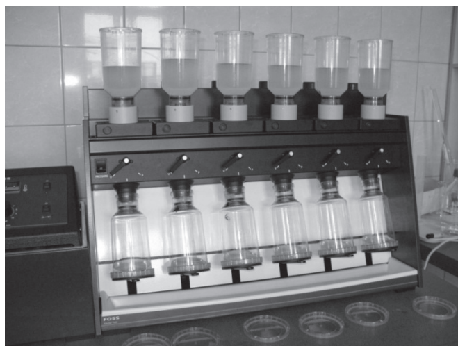
Figure 1. FOSS Analytical Fibertec E 1023 System.

The total dietary fibre in these samples was determined according to the AOAC approved method No. 985.29 by FOSS Analytical Fibertec E 1023 system (Fig. 1).