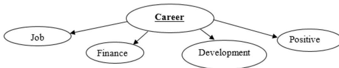
Figure 1. Key elements of term “career” in work with long-term unemployed social benefits receivers.

While working with long-term unemployed social benefits receivers it is important to emphasize development – it means changes and moving forward from existing situation not only in the work field, but in all life aspects, because starting changes in one of the aspects changes everything. It would be hard to overestimate importance of searching job which is crucial in changing their status of long-term unemployed. Finding job means also changes in financial fields – individual is able to be independent. Being employed also means having positive attitude as well as self-acceptance and mental stability (Figure 1).