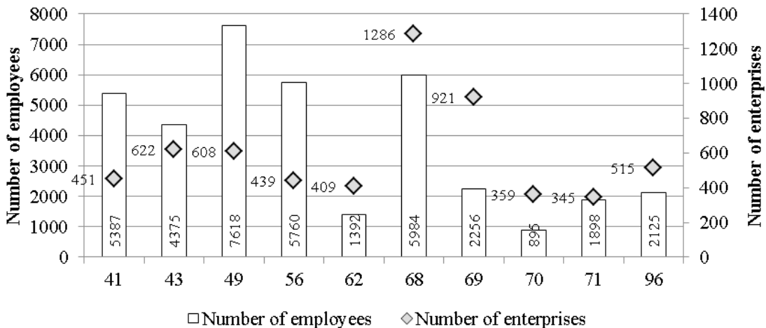
Figure 3. TOP 10 most widespread sectors of economy in Latvian towns, number of employees and number of enterprises in 2013, n=3382.

41_Construction of buildings; 43_Specialised construction activities; 49_Land transport and transport via pipelines; 56_Food and beverage service activities; 62_Computer programming, consultancy and related activities; 68_Real estate activities; 69_Legal and accounting activities; 70_Activities of head offices; management consultancy activities; 71_Architectural and engineering activities; technical testing and analysis; 96_Other personal service activities.