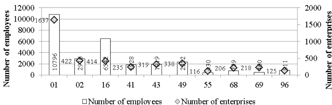
Figure 1. TOP 10 most widespread sectors of economy in Latvian rural districts, number of employees and number of the enterprises in 2013, n = 3721.

01_Crop and animal production, hunting and related service activities; 02_Forestry and logging; 16_Manufacture of wood and of products of wood and cork, except furniture; manufacture of articles of straw and plaiting materials; 41_Construction of buildings; 43_Specialised construction activities; 49_Land transport and transport via pipelines; 55_Accommodation; 68_Real estate activities; 69_Legal and accounting activities; 96_Other personal service activities;