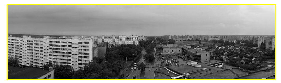
Panorama of Narva-Ivangorod

In Scandinavian city panoramas water plays important role (Fig. 1). It forms impression of a port like city where ships and boats are located. This makes the landscape more interesting. Scandinavian landscapes have also hills in the background. Clusters of trees appear among the buildings, which visually connects parts of the landscape. The panorama of Tornio-Haparanda is harmonious and balanced.