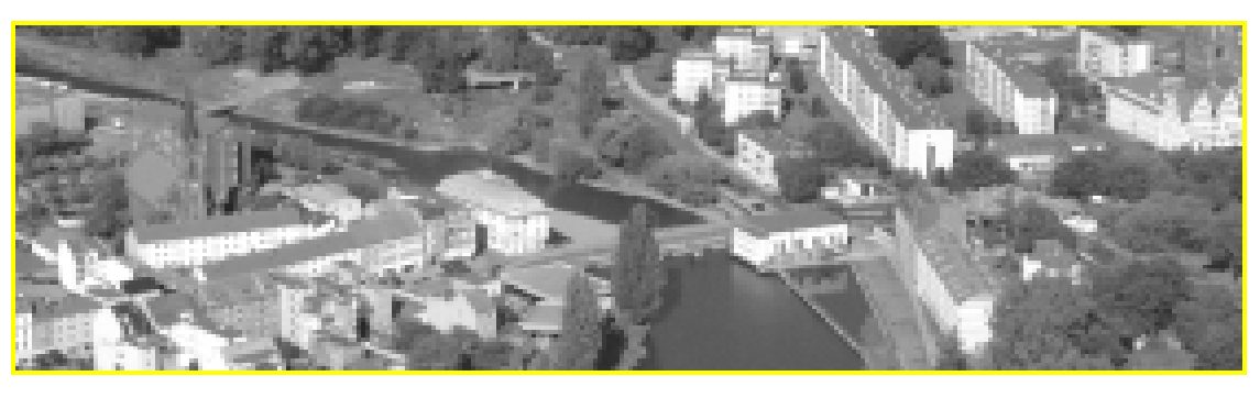
Panorama of Guben-Gubin.

The river divides border town in two separate parts but it looks that this is the same town (Fig. 3). Here are not visually contrasting components. The architecture and landscape looks similar. Panorama is supplemented by bridges that like switch connects the towns. Here are the green wedges which smoothes the urban environment. The landscape of Guben-Gubin is balanced but some vertical accents are needed.