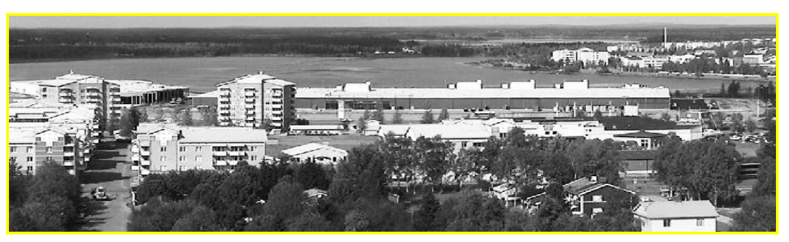
Panorama of Tornio-Haparanda (www.haparanda.se/webbkamera/panoramabilder).

In Scandinavian city panoramas water plays important role (Fig. 1). It forms impression of a port like city where ships and boats are located. This makes the landscape more interesting. Scandinavian landscapes have also hills in the background. Clusters of trees appear among the buildings, which visually connects parts of the landscape. The panorama of Tornio-Haparanda is harmonious and balanced.