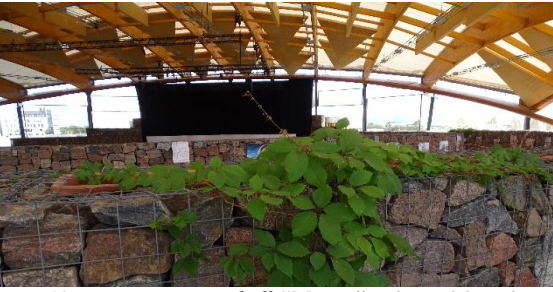
Fig.13. Open-air concert hall "Mītava" indoor of the urban landscape (View line L )