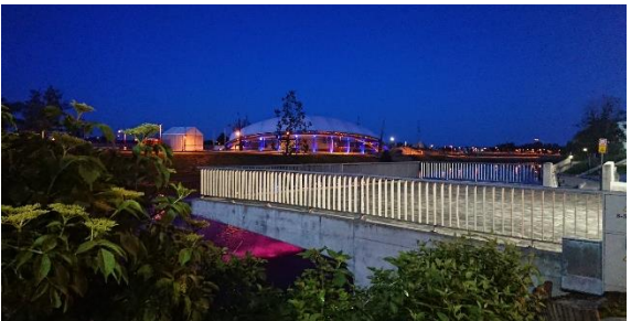
Fig. 8. Open-air concert hall "Mītava" in the landscape area (View line G)