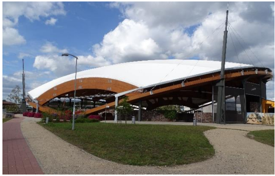
Fig. 7. Open-air concert hall "Mītava" in the landscape area (View line F )