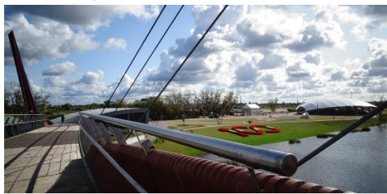
Fig. 2. Open-air concert hall "Mītava" in the landscape area, viewing from the pedestrian bridge "Mītava" (View line A)

rhythms of the day and season in Latvia. The long twilight hours of day and night alternation, the four seasons with different lighting and the changing meteorological weather affect only one aspect. In addition, artificial lighting produces a complex set of influencing factors (Figure 1; TABLE 5; 6).