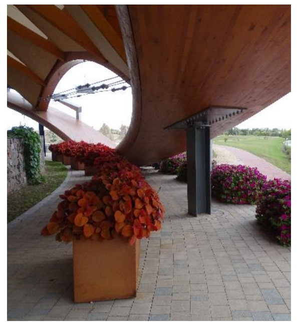
Fig. 14. A view from the Open-air concert hall "Mītava" indoor of the urban landscape (View point M )