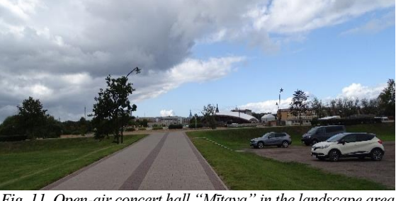
Fig. 11. Open-air concert hall "Mītava" in the landscape area (View line J )