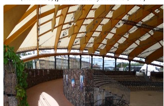
Fig. 12. A view from the Open-air concert hall "Mītava" indoor of the urban landscape (View point K ) [photo created by the author, 2019]