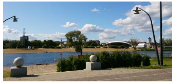
Fig. 4. Open-air concert hall "Mītava" in the landscape area (View line C)