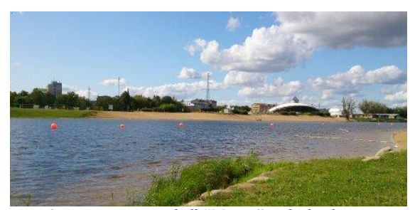
Fig. 6. Open-air concert hall "Mītava" in the landscape area (View line E)