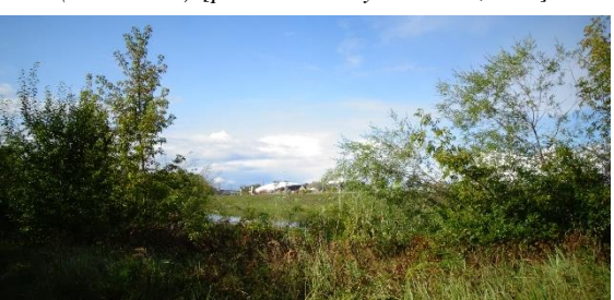
Fig. 10. Open-air concert hall "Mītava" in the landscape area (View line I)