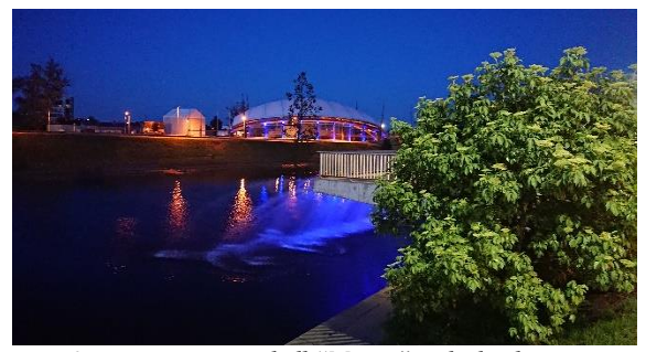
Fig. 9. Open-air concert hall "Mītava" in the landscape area (View line H )