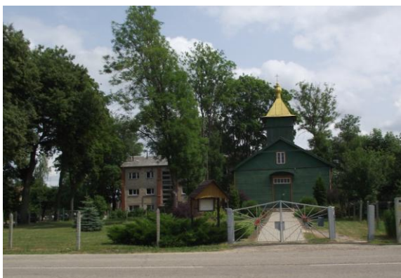
Fig. 1. Old believer church in Ludza