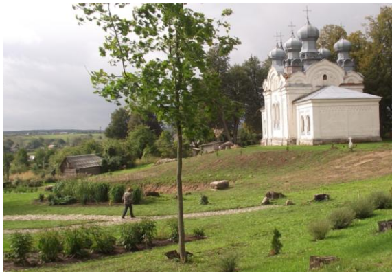
Fig. 3. Orthodox church in Piedruja