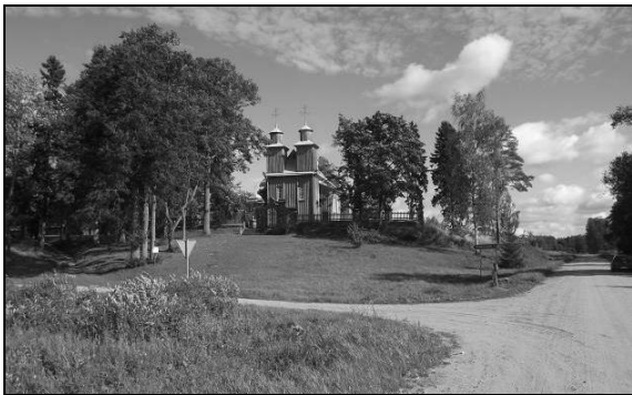
Fig. 2. Well preserved Bērzgale catholic church landscape.