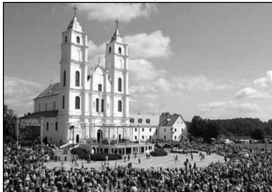
Fig. 7. Aglona basilica during the 15 of August, with pilgrimage [16].

Tourism that is connected with the cultural heritage can be considered as a social phenomenon [21]. Although a view exists that it is enough to feel [33], it is also important to see and take particular interest in this territory and objects. The researches of the field of tourism on cultural heritage have developed in various directions that are connected with architectural elements, elements of culture and nature [21].