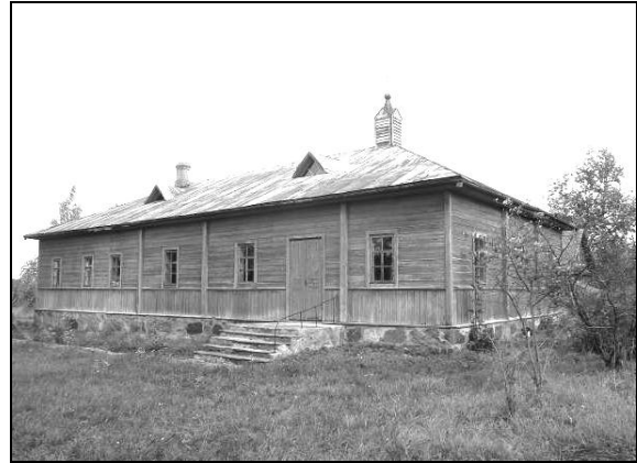
Fig. 5. Ustroņu catholic church territory left without attention.

The local people are the ones who live and form this environment [12]. Landscape creates the quality of life, but it is also important to remember that the protection of landscape, management and planning are directly connected with the society which is responsible for it [37]. The processes of landscape transformation are affected not only by the quality of landscape protection, management and planning, they also interact with the local society, its level of education and social activity. It is necessary to include the opinion of experts and society in the decision-making process on landscape management, as well as to conduct a survey of the local people as the perception of the place may vary in regions.