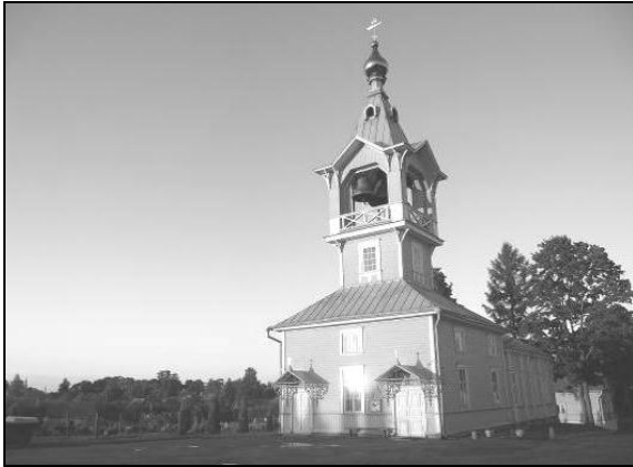
Fig. 1. Photograph well preserved rēzeknes old believer church landscape.