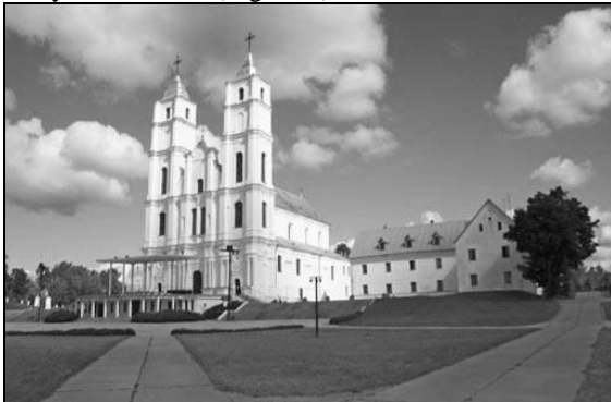
Fig. 6. Aglona basilica in usual summer day, and during the 15 of August, with pilgrimage [24].

Religion is not only the centre of life for many people but it is also affected by human migration and tourism. Religion is considered not only as a motivation to travel around one's own country but also to go on international trips [5, 13, 22, 30]. Sacred places can be divided into three groups: pilgrimage shrine, religious tourist attraction point; religious festival place [18]. Sacred places in Europe mostly fall into one of these groups [30]. The same division exists also in Latvia. Most of the church landscapes in the Latgale Upland are tourist attraction points as described in the official website of the Latvian Tourism Development Agency [32]. The basilica in Aglona, which also is located in the Latgale Upland, is a popular destination in Latvia for local and foreign tourists, and pilgrims, where hundreds of thousands of pilgrims every year arrive for the feast of the assumption of Blessed Virgin Mary into heaven (Fig. 6, 7).