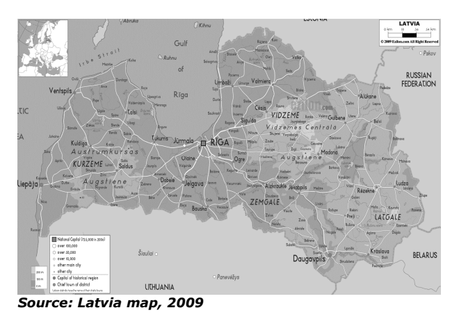
Fig. 3. The map of Latvia

Jelgava, LLU ESAF, 27-28 April 2017, pp. 307-314 other regions shows that utilised agricultural areas in Kurzeme and Riga regions have declined by 10 416 ha and 8 610 ha respectively. In Zemgale region, total UAA has decreased by 9 509 ha in 2016 compared with 2011 irrespective of the UAA increase compared with 2015. The research authors believe that the terrain in Latgale and Vidzeme regions serves as the basic reason for the decline of utilised agricultural areas there (Figure 3).