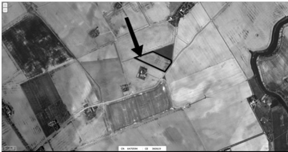
Figure 1. Overview of the case study area in the northern plains of Götaland

The model was tested in a case study on a willow cultivation in the northern plains of Götaland (Figure 1). The willow field is 3 hectares, fertilized with sewage sludge and mineral nitrogen, with a yield of 12 500 kg dry matter per hectare and year. The soil type is clay loam. As a reference, cultivation of ley and winter wheat on the same field was also put into the model.