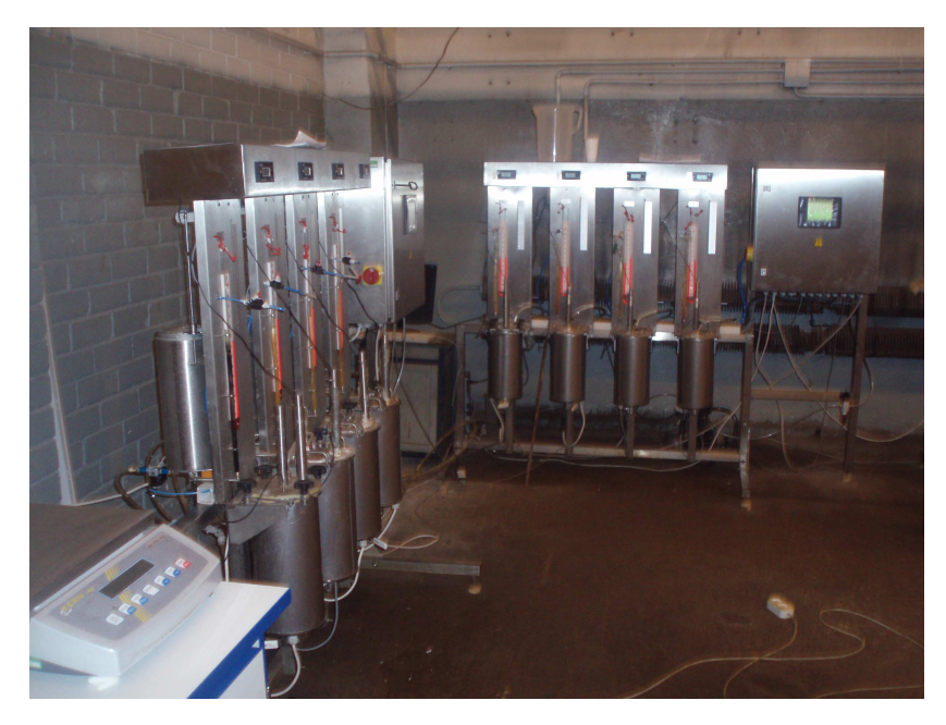
Laboratory digesters for investigation of biogas from biomass

Chicken manure with sawdust litter was filled in the digester D1 (Table 1) and chicken manure (with sawdust litter) mixture with slaughterhouse waste was used in the digester D2. Mixtures of fresh sawdust with water were filled in digesters D3 and D4, and old sawdust mixtures with water were filled in digesters D5 and D6. Grain mill waste mixtures with water were used in digesters D7 and D8. Fermented cow's manure was added to all digesters in the ratio of 24 % to 35 %, to provide methanegenous microbial inoculums for a successful anaerobic fermentation process (Table).