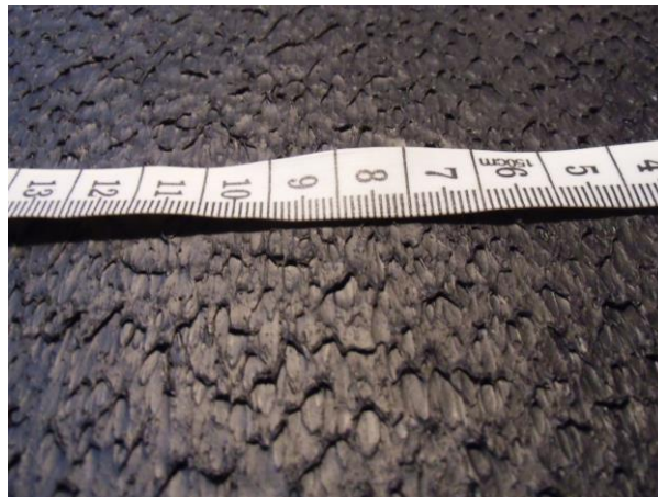
Fig. 4. Geomembrane texture pattern

Non woven (needle punched) geotextile was 2,5. mm thick and its surface density was 175 g/m^2 .