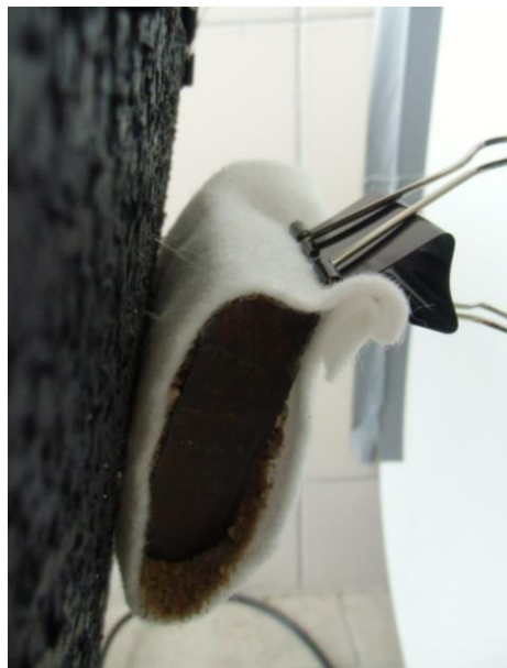
Fig. 5. Box with geotextile wrapped around just before the moment of break off from textured surface of geomembrane.

G - weight of the box, filling from gravely sand, and geotextile