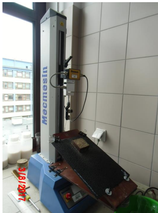
Fig. 1. Strength testing machine adopted to the inclined plane friction test

at which the box's displacement attains 50 mm. Test arrangement (Fig.2) presented in the paper, was prepared not to control sample displacement, but to measure force “V” lifting the plane and to determine displacement of inclined plane free end. When box with soil starts to move changing the position on the plane, sudden drop of lifting force, because of load movement, can be observed. This moment is precisely determined by measuring system of the strength testing machine. Slipping angle \delta can be easily determined from the diagram presenting values of lifting force versus vertical displacement of the plane end (Fig. 3).