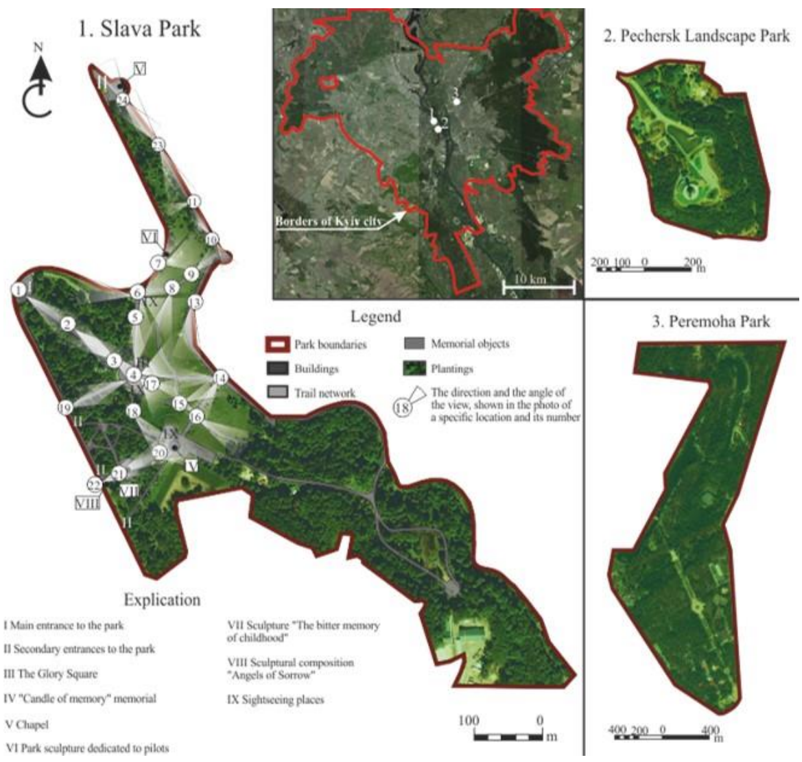
Fig. 1. The location of war memorial parks in Kyiv. The locations scheme in the Slava park, which were used to evaluate the aesthetic appeal of the park and the angles of view that are reflected in the photographs.

The second is based on the use of the semantic differential [11].