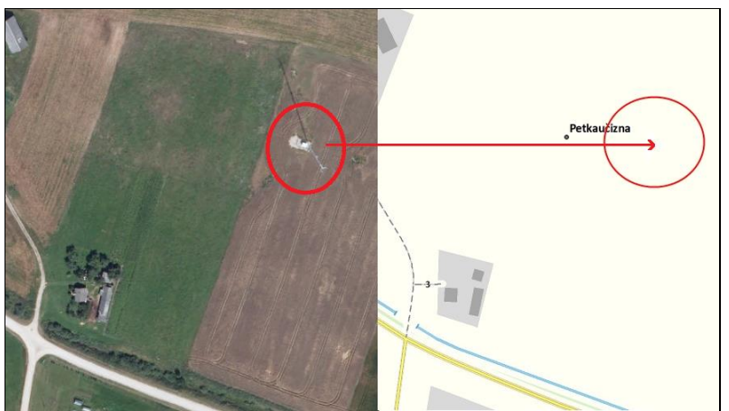
Fig. 2. Unmarked navigational obstacle in ORT10LT and approximate location in GDR10LT

The third chosen area (III) is the largest and different from the first two as it is a rural territory with the abundance of agricultural land. It is Žasliai cadastral area in Kaišiadorys district. Minor map discrepancies were found in this area compared to the terrain situation but their amount was the least. It should be emphasized that three communication towers are located in Žasliai cadastre locality. Two of them are present in the northwest part of cadastre; their approximate coordinates are as follows: (1: X 538026, Y 6079502 and 2: X 538023, Y 6079620). The coordinates of the third tower are: X 538958, Y 6079553. All the mentioned towers are seen in the orthographic map; they can be interpreted according to the contrasting colour and shadow falling on the farming land. During the field research it was determined that one tower (X 538958, Y 6079553) was not marked in GDR10LT (Fig. 2).