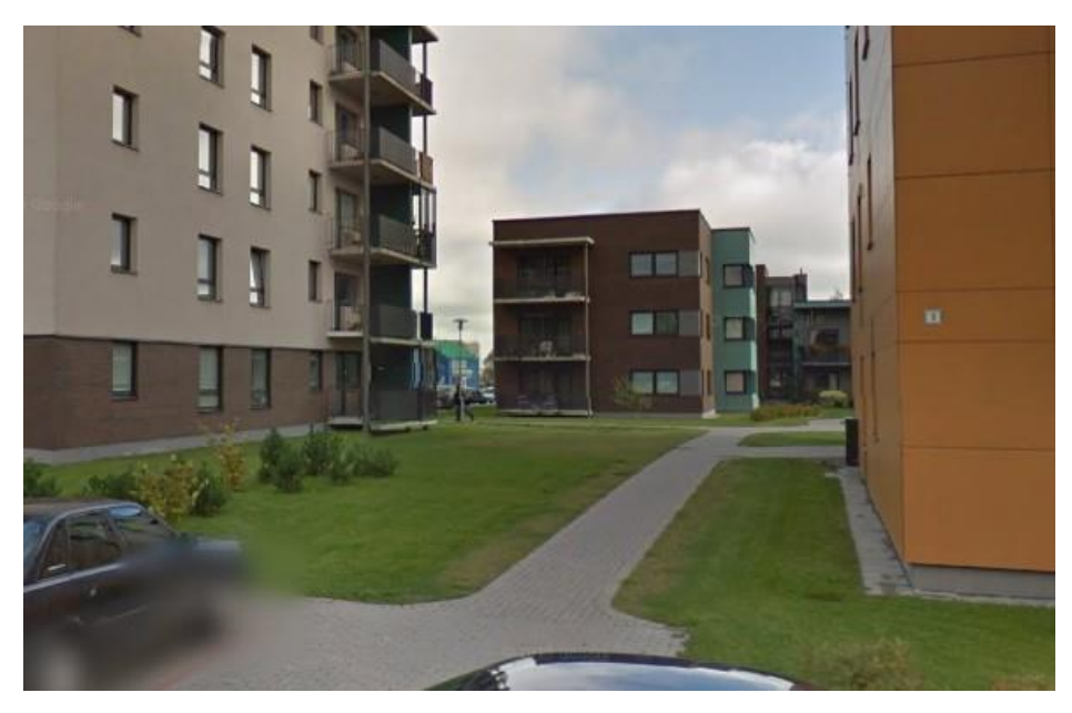
Fig.1. Green areas at the residential buildings (Eitkūnų str. 1,3) (Google..., 2014)

When analyzing the General Plan of Kaunas, it was determined that some parts of the spaces of the city did not have their own regional green areas. Those territories were rather far from the larger zones of green areas to be used for recreation. The disadvantages concerning the regional recreational green areas are in the neighborhoods of Aleksotas, Freda, Birutė, Romainiai, Milikonys, Sargėnai. The distribution of recreational green areas allocated for general use, the size of the territories, do not exactly correspond to the urban structure of the city or, in other words, the shortage of green areas is mostly registered in the most densely populated neighborhoods; but they are in abundance in the rarely inhabited suburban neighborhoods. The neighborhoods with multistoried residential buildings most of all lack well preserved recreational green areas in those territories.